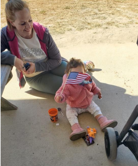
Veterans - VA Hospital / Delaware Veterans